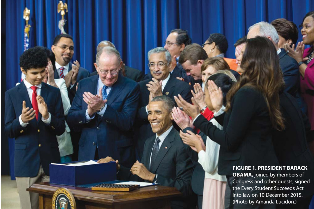
FIGURE 1. PRESIDENT BARACK OBAMA , joined by members of Congress and other guests, signed the Every Student Succeeds Act into law on 10 December 2015.

the free market to determine whether schools and school districts hire physics teachers with, say, bachelor's degrees in physics or academy graduates who may never have formally studied physics at all. And that was precisely the intent of the legislation's designers—to allow market forces, rather than content-area experts, to determine how teachers of physics and all other subjects are prepared.